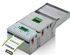
915AH030700700 PRINTER KPM180H LL RFID UHF ETH USB RS232 CUT PRES AVIATION

Via I. Newton, 4 - 43010 Fontevivo PR - VAT: IT02498250345 - TEL: +39 0521 680111 - FAX: - UNIQUE CODE: 8RQN7AZ