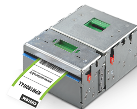
915AH030200700 PRINTER KPM180H LL ETH USB RS232 CUT PRES AVIATION