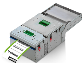
915AH021000700 PRINTER KPM180H RFID UHF ETH USB RS232 CUT AVIATION