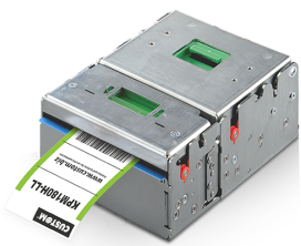
915AH021300700 PRINTER KPM180H ETH USB RS232 CUT AVIATION