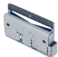
Cutter Unit (General / for Liner-Less)